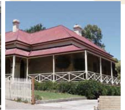
Above (l-r): Mitcham Police Station and Institute, 1897-1900 ; Houses in the City of Mitcham today.

The vision for the City of Mitcham is not just about future development. It is about protecting our heritage and cultural assets.