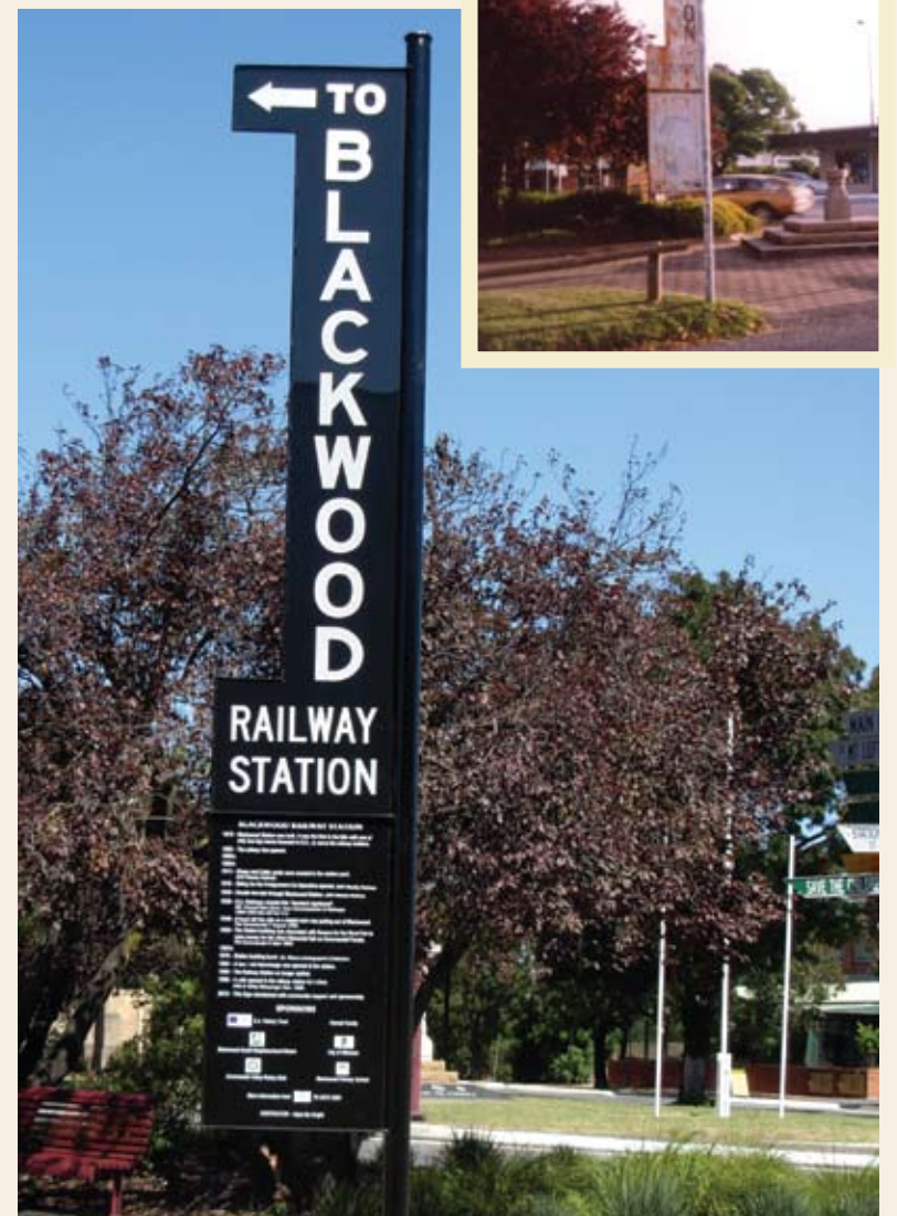
Above: The restored Blackwood Railway Station sign. Inset: The old sign.

To discover more about local history drop into the centre or call 8372 8261.