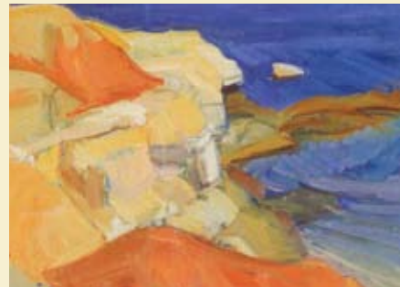
Ochre Cliffs and Gull Rock looking south from Maslin Beach.

For more information call 0418 829 034 or visit www.mitchamhistoricalsociety.org.au