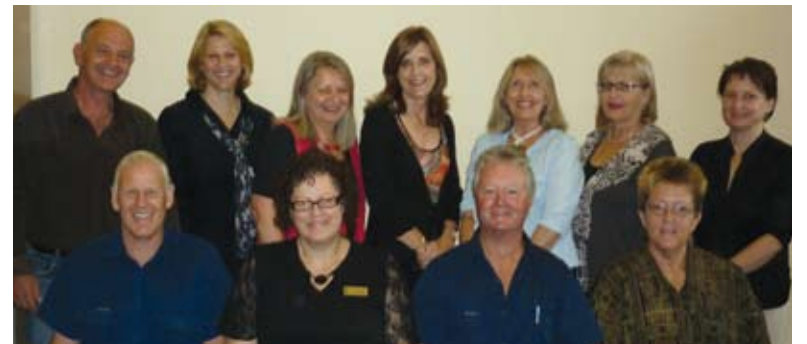
Congratulations to the Positive Ageing and Community Care Team

The external appraisal is required as part of Council's Home and Community Care funding and service agreement. The appraisal begins with a comprehensive self audit against the seven Home and Community Care national service standards with evidence of how