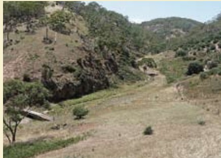
Hidden Valley of Brown Hill Creek.