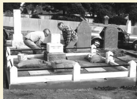
Giving our Cemetery a future. Descendants working on the Hanns grave in Mitcham General Cemetery 1996.

For more information call Carrick Hill on 8433 1700 or visit www.carrickhill.sa.gov.au