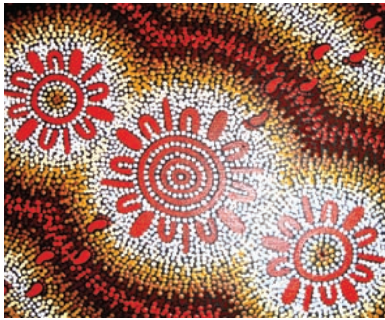
JACINTA NUNGARRAYI DIXON

The exhibition includes a painted 90 year old dining table, a totem pole and beautifully detailed skate board.