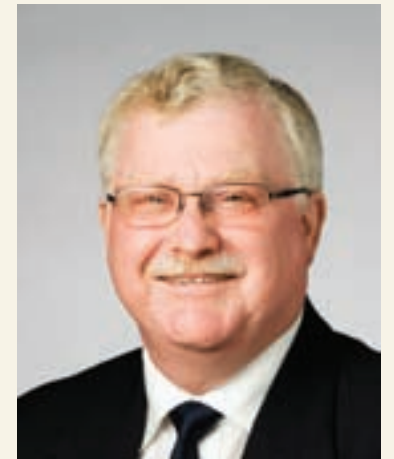
THE PARK WARD

dissatisfaction for residents. In response Council has spent many millions of dollars replacing old and unsafe footpaths and providing new ones in the time I have been on Council. The emphasis remains on replacing damaged footpaths due to legal liability reasons whereas Council has no liability for injury where no footpath has been provided. Over the last four years Council has spent $6.295m on footpath replacement and $946K on new. In 2009/2010 the budget for new footpaths was $336.2K which will provide 1.7km when completed. During budget consideration this year it has been proposed to increase this amount significantly but as the money comes directly from rates it is a balancing act between other demands, rate increase and more money for new footpaths.