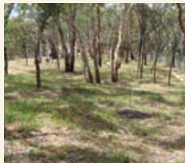
[Above top] Sheoak Road (northern side) after the prescribed burn and [above bottom] thinning of vegetation in January.