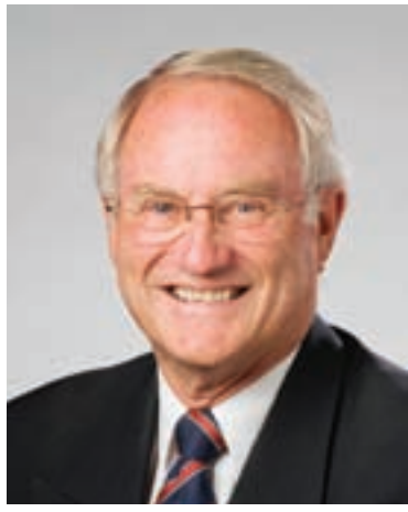
MAYOR IVAN BROOKS