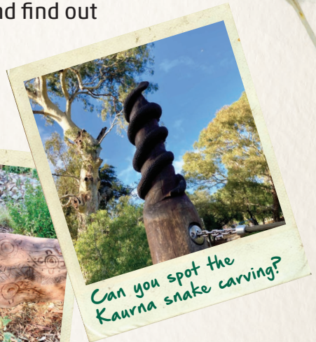
Can you spot the Kaurna snake carving?