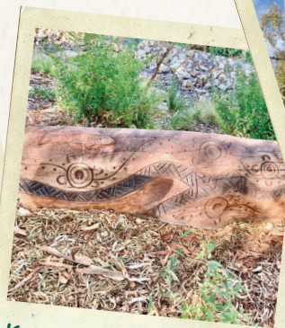
Kaurna carved log seat