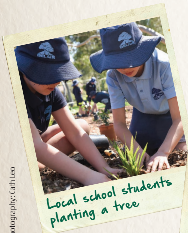
Local school students planting a tree