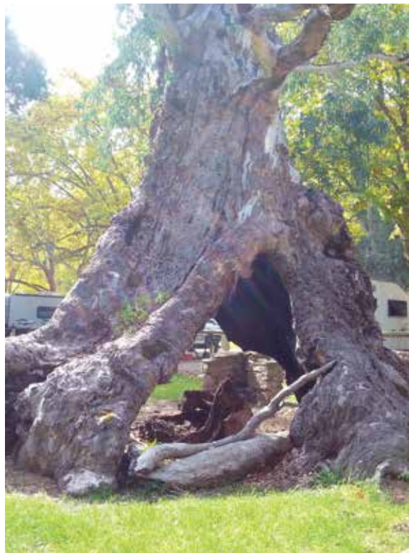
Above: The Monarch of the Glen, 2016.

Mitcham Reserve's River red gums have been given the best chance of reaching grand old age for future generations to enjoy.