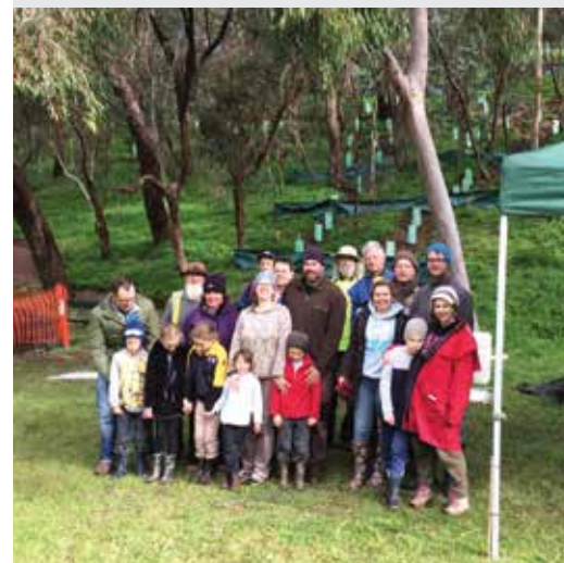
Above: Trail maintenance volunteers, members of the Belair Scout Group and Bush for Life volunteers at a community planting day in July.

If you would like to find out more about Council's trail network or get involved, call 8372 8888 or visit www.mitchamcouncil.sa.gov.au/trails