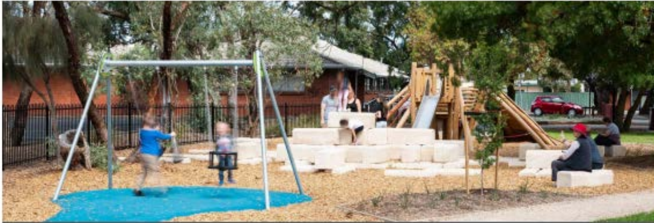
Waite Street Reserve upgrade, incorporating Young Street & Pedestrian Connection (Blackwood) Public realm improvements in the heart of Blackwood