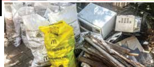
The Blackwood Action Group cleaned up the approaches to the Blackwood Roundabout as part of Clean Up Australia Day last month.

The City of Mitcham would like to thank all residents, community groups, environmental groups, Scouts, Church groups and schools who participated in the day, contributing to a clean and safe Mitcham we can all enjoy.