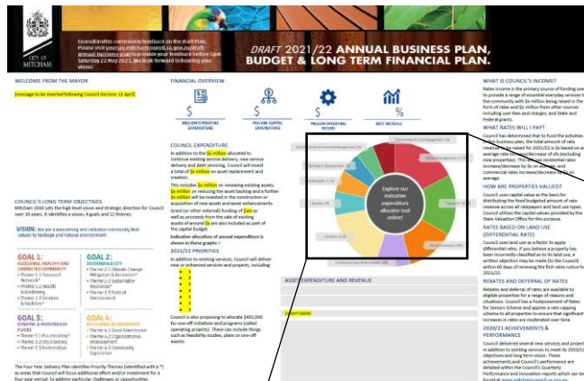
ABP draft Summary